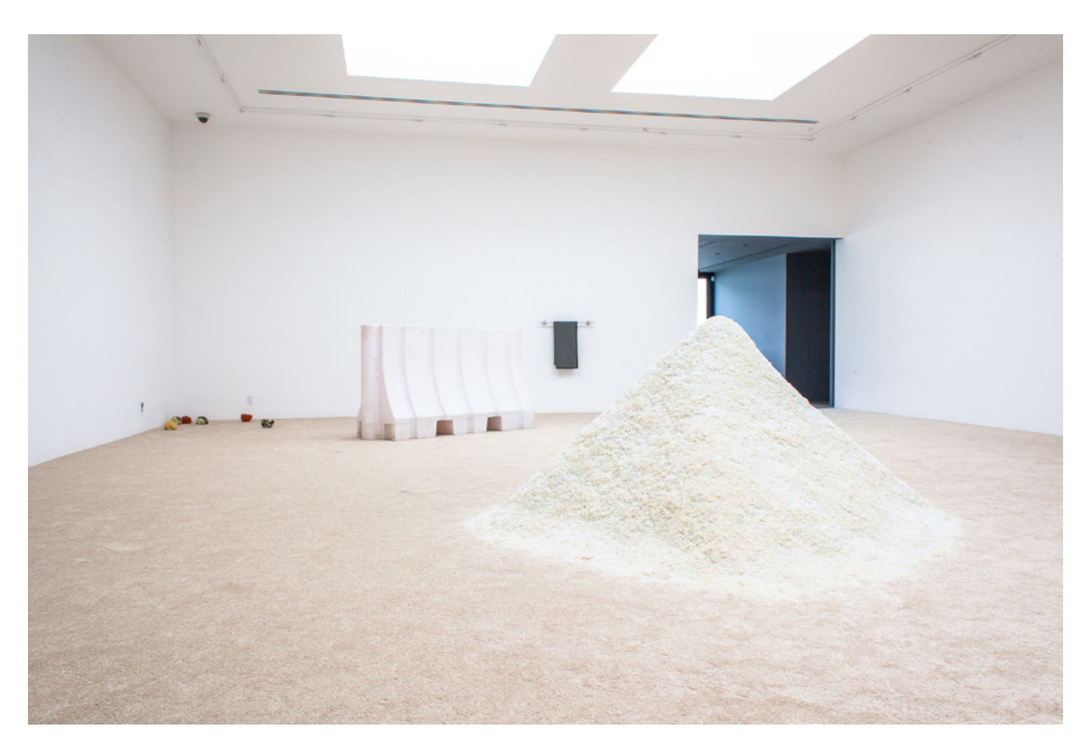
Amy Yao, Doppelgangers (2016), courtesy of the artist and Various Small Fires.

here are 15 pieces in Yao's show "Bay of Smokes," but one work transcends its counterparts so glowingly that it's hard not to long for a one-work show. Or at least with a caveat: one work per room. The piece in question, called Doppelgängers (all works 2016), is a chest-high pile of rice in a loose pyramid, near the gallery's center, its cement floor covered in light-beige carpeting. The apt title refers to the pile's lack of uniformity,