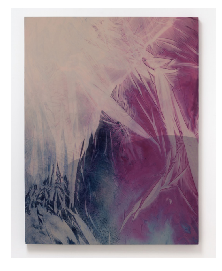
April Street , Wandering Limb #34 (2015). (heartbreaker with dusting powder)" (2015), acrylic and pastel on hosiery over canvas painting, 68 x 52 in.

representational imagery. The largest of the flat hosiery works, "Wandering Limb #14," uses the same materials and techniques for another end and appears solid, like an animal hide mounted for display like a trophy from a hunt. Indeed, looking at the full body of work included in Lay Down Your Arms, the title becomes an obvious allusion to hunting, and perhaps more broadly to a society that values it — like the US.