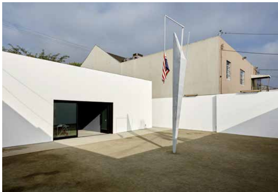
Installation view of Inverted Capitol Spire, Programmatic Architecture Displacement 5 , 2014, at Various Small Fires in L.A.